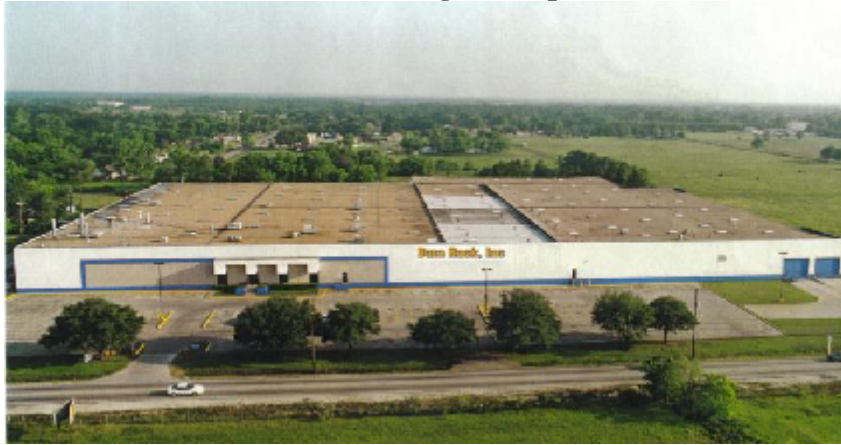
237,000 sq. ft. manufacturing facility

Our Company had its start in 1930 and although we have had changes in manufacturing sites, we have a continuous record of manufacturing quality material handling products. During the last 72 years, our goal has been to improve our products and efficiency in manufacturing.