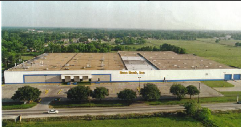
237,000 sq. ft. manufacturing facility

Our Company had its start in 1930 and although we have had changes in manufacturing sites, we have a continuous record of manufacturing quality material handling products. During the last 72 years, our goal has been to improve our products and efficiency in manufacturing.